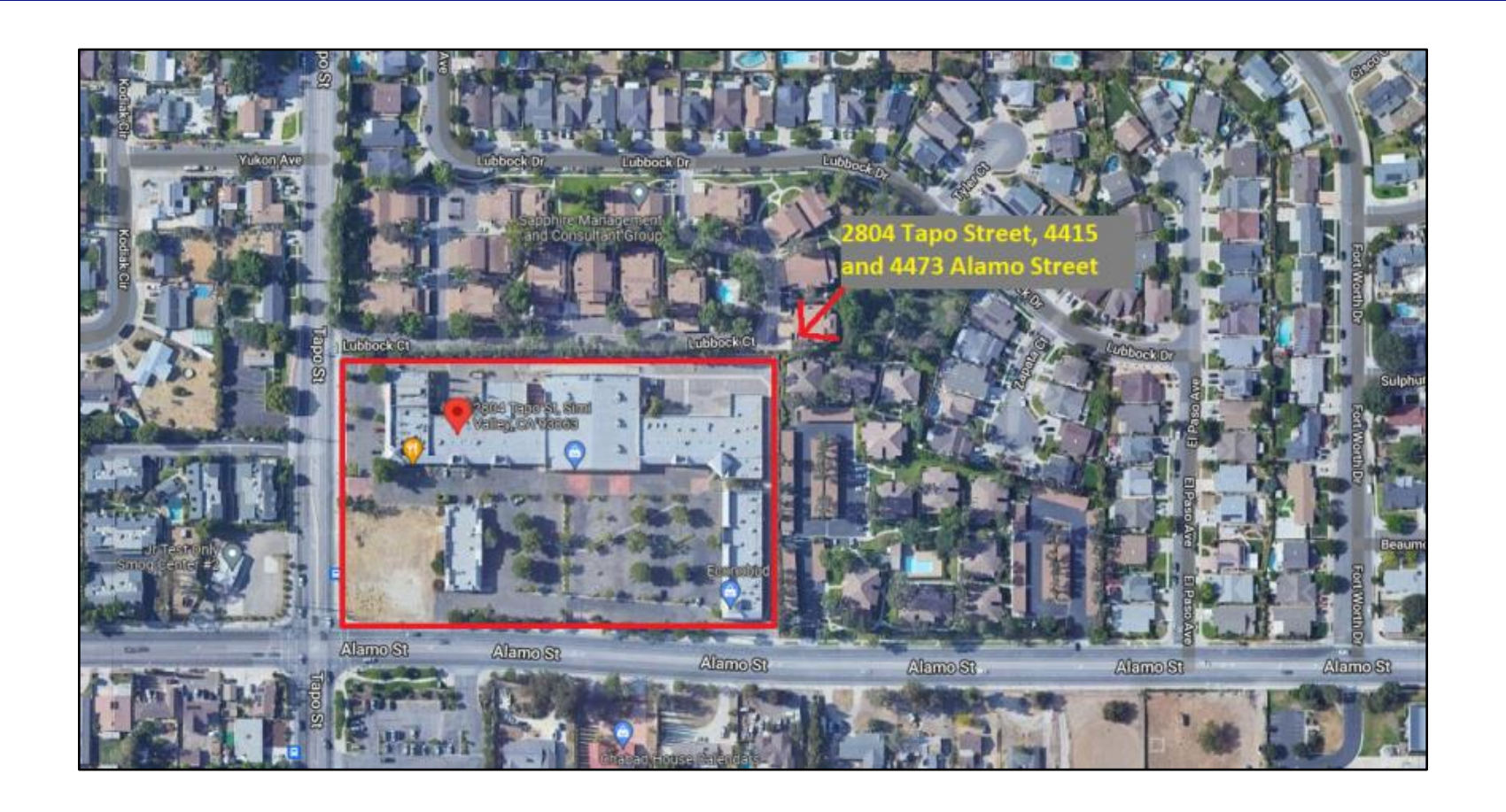
Subject Site – Near Aerial Map